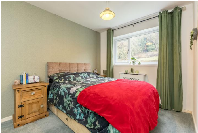
Bedroom 2 11'4" x 8'7" A double bedroom with window to the rear and central heating radiator.