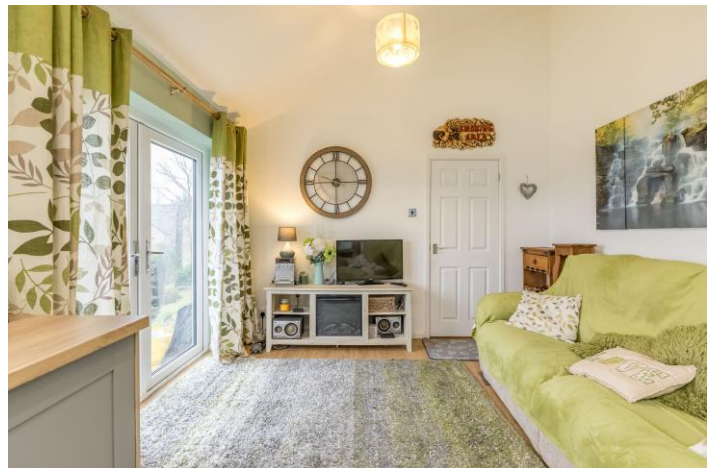
Living / Dining Kitchen 19'3" x 11'3"

A good sized kitchen with living and dining area featuring windows and glazed double doors to the front enjoying the views, a high angled ceiling, laminated flooring and central heating radiator. The kitchen area is fitted with a range of modern base units and wall cupboards with laminated worksurfaces, stainless steel sink with mixer tap, plumbing for automatic washing machine and tiled splashbacks.