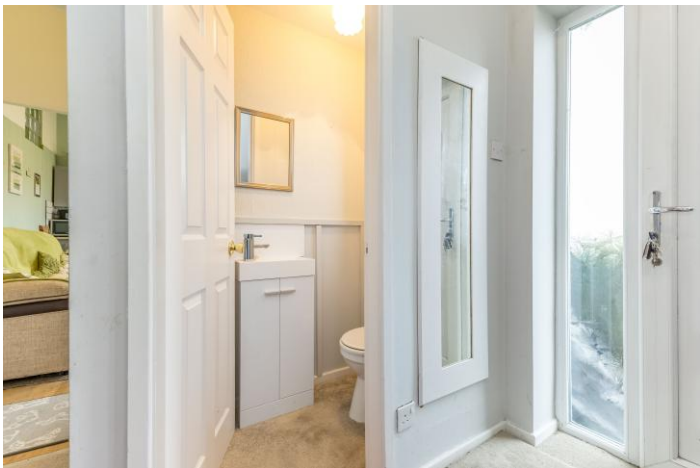
Cloaks / WC

A spacious entrance hall with uPVC entrance door, high angled ceiling, built in storage cupboard, stairs leading to the upper floor and central heating radiator.