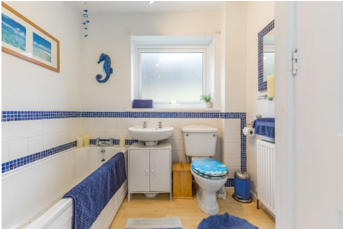
Bathroom 8'3" x 7'2" With low flush wc, pedestal washbasin and bath, separate shower cubicle, cupboard housing the hot water tank, obscure glazed window to the rear and central heating radiator.