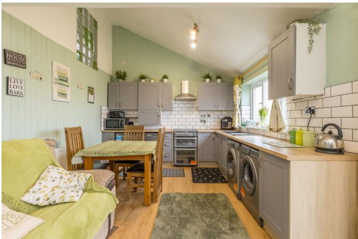
Living / Dining Kitchen

With low flush wc, vanity washbasin and obscure glazed window to the front.