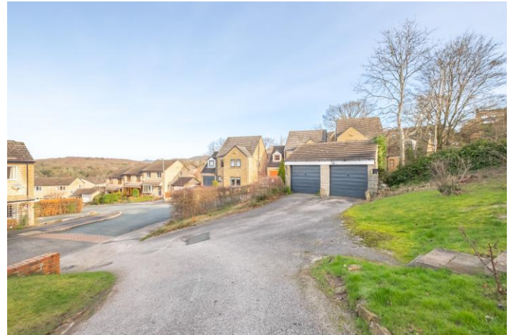
In front of the house there is a garden area with steps up to the front of the house, a driveway and detached double garage to the side of the plot. There is also a side paved area with greenhouse.