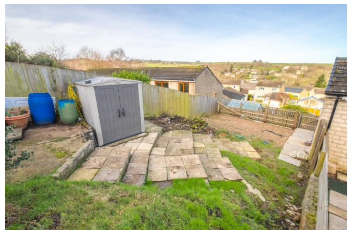
Rear Garden To the rear of the house is an extensive enclosed garden which runs right up to New Mill Road. This has a paved patio area along the rear of the house, grassed garden area and a further uncultivated area beyond with trees.