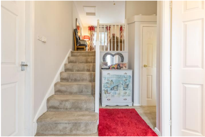
Entrance Hall 11'9" x 8'11" overall

A spacious entrance hall with uPVC entrance door, high angled ceiling, built in storage cupboard, stairs leading to the upper floor and central heating radiator.