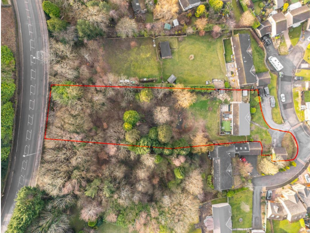
9 Heys Gardens, Thongsbridge