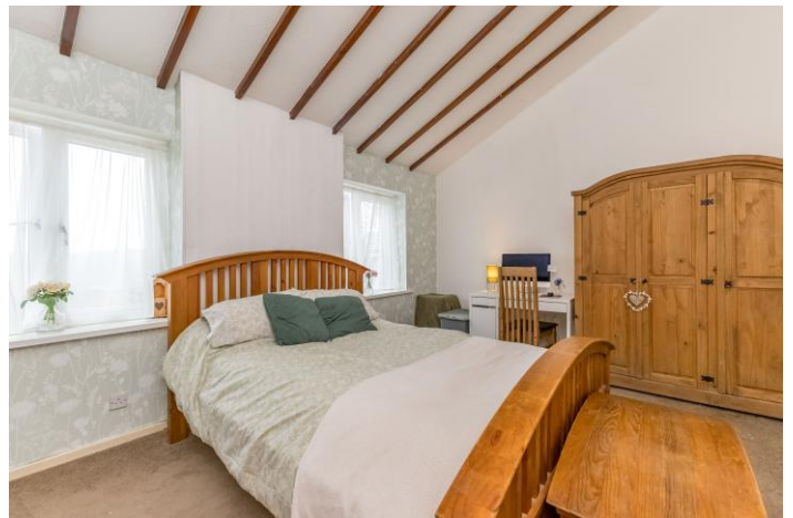
Bedroom 1 16'10" x 11'9"

A good sized kitchen with living and dining area featuring windows and glazed double doors to the front enjoying the views, a high angled ceiling, laminated flooring and central heating radiator. The kitchen area is fitted with a range of modern base units and wall cupboards with laminated worksurfaces, stainless steel sink with mixer tap, plumbing for automatic washing machine and tiled splashbacks.