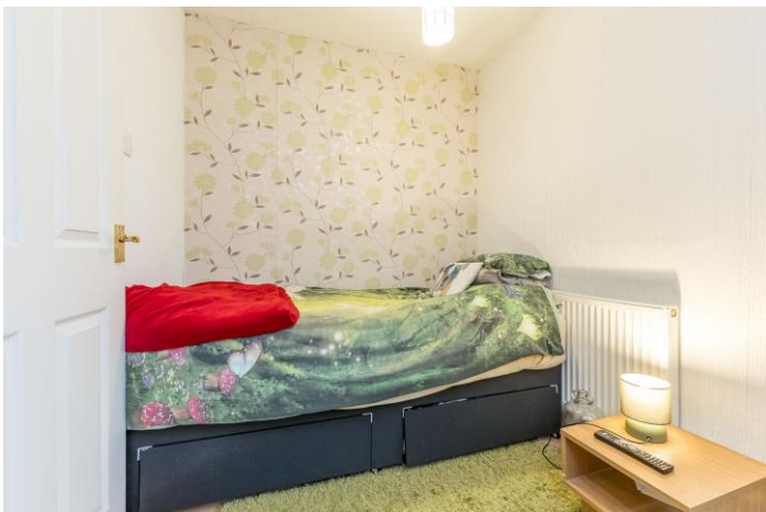
Bedroom 3 11'3" x 6'8" (7'8" max) With window to the side and central heating radiator.