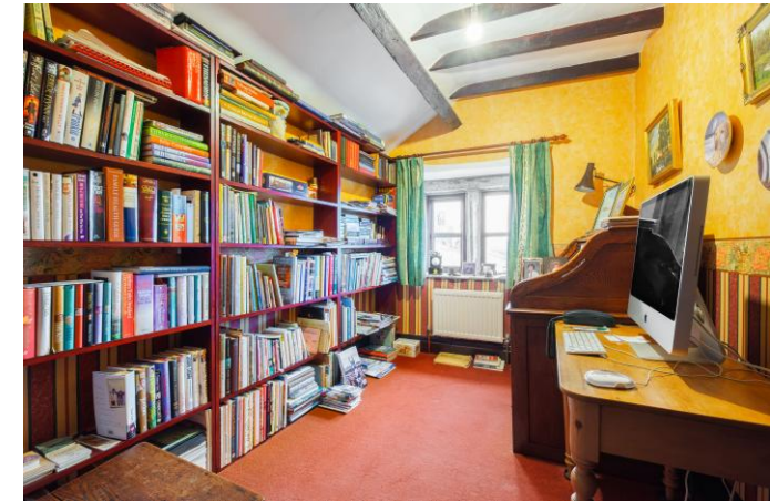
Office 9'10" x 7'4" Having a mullioned window to the side offering views down the valley.