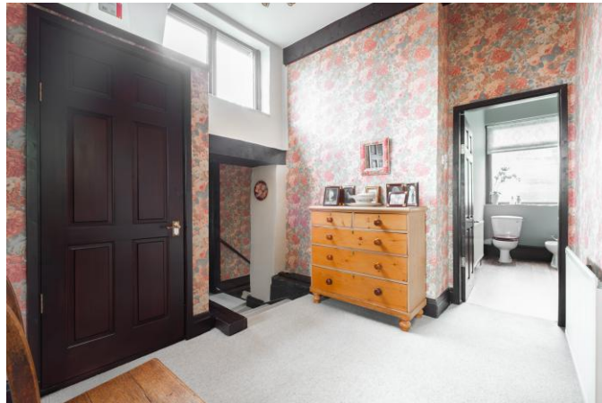
Landing Split level landing areas with beams, loft access, and cylinder cupboard.