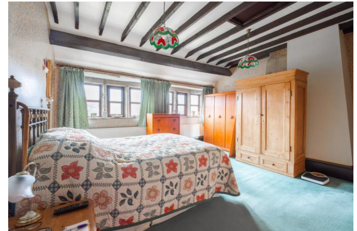
Bedroom 1 15'8" x 15'6" A large double bedroom with beams, and stone mullioned windows to the front offering great views across towards Butterley Reservoir and beyond. There is access over a galleried landing area which leads on to the en-suite shower room.