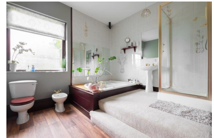
Bathroom 10'9" x 10' A large bathroom space fitted with a white suite comprising a large sunken bath with telephone style mixer tap, pedestal wash basin, low flush w.c., bidet, and shower cubicle with electric shower over. There are part tiled walls with inset mirrors, frosted window to the side, and shaver socket.