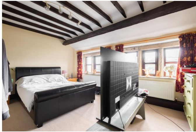
Bedroom 5 10'2" x 7'3" With beams, and window to the rear offering views up the fields.