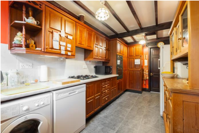
Kitchen 16'11" x 8'9" Fitted with a range of wall, drawer and base units with ample worksurfaces over which incorporate a 1½ bowl stainless steel sink with mixer tap. There is a 4-ring gas hob, double oven, and space for other kitchen appliances. There is a window and door to the side, tiled floor, and beamed ceiling.