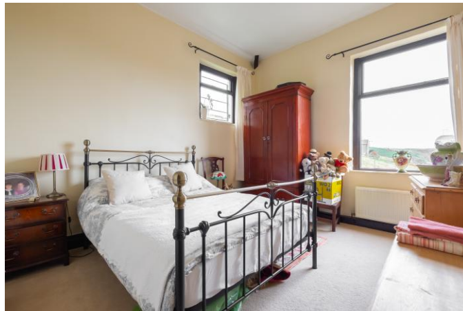
Bedroom 3 12'8" x 10'7" This double bedroom has windows to the side and rear with great views looking down the valley.