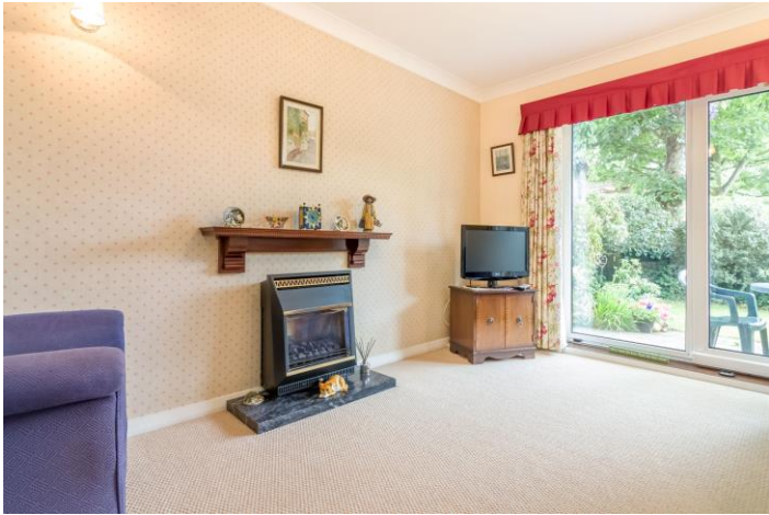
Sitting Room 13'0" x 10'3"

A nice room in which to relax and enjoy looking out through the sliding patio doors over the lovely rear garden. It has a gas fire resting on a marble hearth with a timber mantel over.