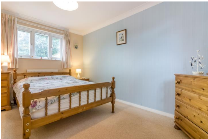
Bedroom 1 13'1" x 10'2"

A double bedroom with windows to the front and rear both offering a pleasant aspect.