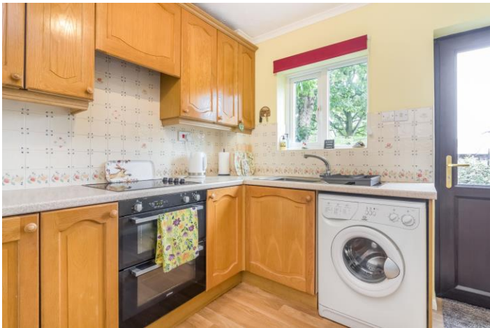
Kitchen 9'0" x 8'2"

Fitted with a range of natural wood fronted wall, drawer and base units with worksurfaces over incorporating a stainless-steel sink with mixer tap. It has an electric 4-ring hob, double oven, integrated fridge, and plumbing for a washing machine. You will also find tiled splashbacks, wood effect flooring, and an external door leading out to the rear garden.