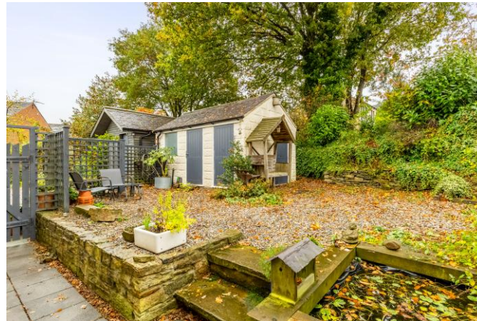
Outhouse/Store 14' 8" x 9' 3"

The summer house is a good size and there are four good sized windows, lighting and power. This may be used as a studio, garden room, workspace or children's play area.