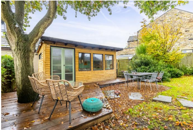
Summer House 15' 3" x 9' 3"

This timber building with a slate roof is a great space and has four windows to the side and front. There is lighting and power. The room can be used for a variety of uses, it is currently used as a hobby and craft space.