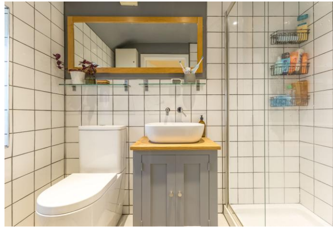
En-suite 7' 6" x 3' 11" Comprising of a three-piece suite in white including vanity basin, with storage beneath, low-level flush WC, glazed panel shower unit, and there is tiling to ceiling height in the main and an obscure glazed double glaze window, and central towel rail radiator.