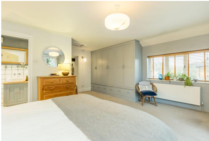
Bedroom 1 18' 1" x 15' 7" overall max Accessed via part of the original house with inbuilt wardrobes to the right-hand side, an exposed beam and then a step rises to the large main bedroom. There are French doors with Juliet style balcony, further windows to two sides and there are a bank of inbuilt wardrobes and access to the en-suite. There is a separate loft access at this point.