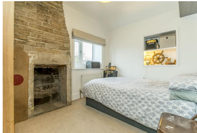
Bedroom 2 10' 6" x 8' 4" to chimney breast Located to the front of the property there is exposed stonework and a feature fireplace, radiator and front aspect windows.