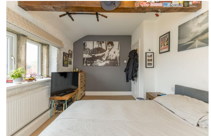
Bedroom 3 13' 3" x 9' 3" to chimney breast Located to the rear/side of the property with mullion windows, exposed stonework and stonework that has been painted to one wall. There are inbuilt cupboards and storage to the right-hand side of the chimney breast, an exposed beam to the ceiling and radiator.