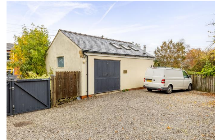
Workshop 24' 8" x 16' 6" This large detached building offers a variety of uses. Currently used as a workshop, or converting this to a garage may be a consideration. The building has three Velux windows and a window to the side. The workshop is accessed via twin timber doors and there is a woodburning stove with relevant flu, lighting and power.

The outside space on offer at Oak Tree Cottage is extensive and offers a variety of options for family life, home based businesses and much more.