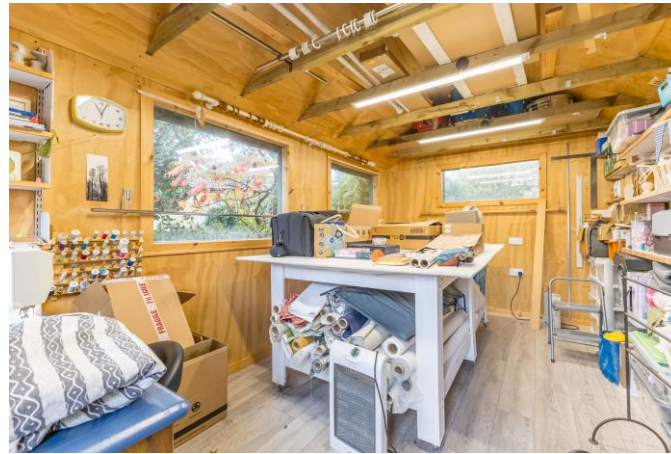
Hobby Room 15' x 9' 3"

This timber building with a slate roof is a great space and has four windows to the side and front. There is lighting and power. The room can be used for a variety of uses, it is currently used as a hobby and craft space.