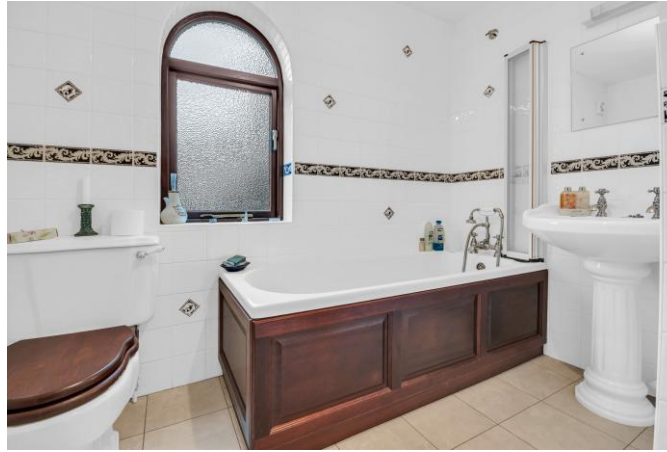
Bathroom 8'6" x 6'7" With low flush wc, pedestal washbasin, bath with mixer shower over, partly tiled walls, built in airing cupboard housing the hot water tank, obscure glazed window to the side.