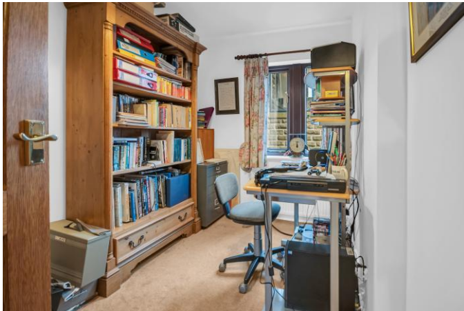
Bedroom 4 / Study 9'9" x 6'7" With windows to the side, central heating radiator.