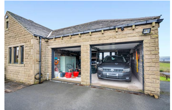
Double Garage 18' x 17'4" A double garage with 2 remote controlled sectional doors, electric light and power supply, windows to the rear and personnel access door to the hall.