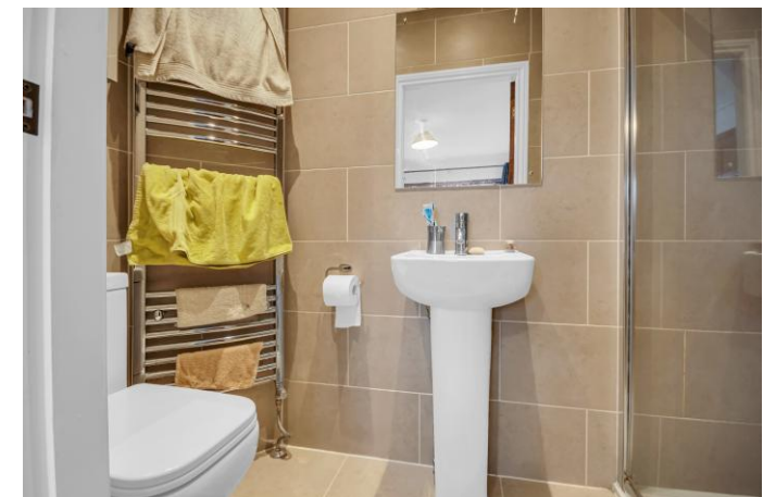
Bedroom 1 & En-Suite