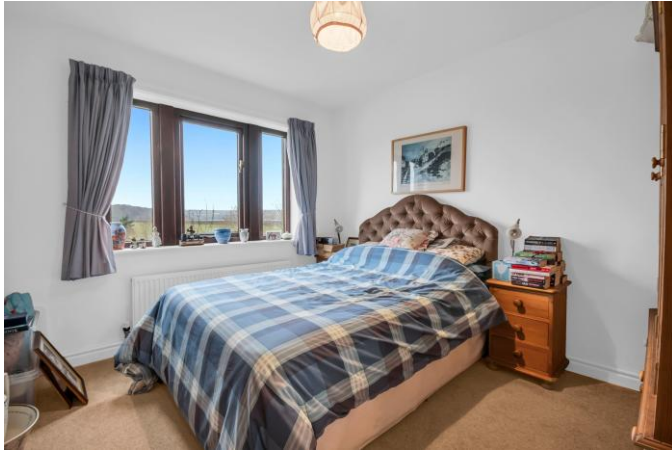
Bedroom 3 10'7" x 9'10" Another double bedroom with windows to the rear and central heating radiator.