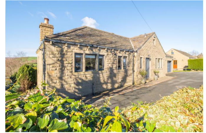
In front of the house, there is a tarmac driveway / parking area with stone wall surround and 2 access points from the road. There is access to the double garage here.