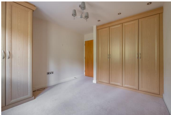
Bedroom 1 12'4" x 10'3"

A double bedroom with windows to the rear, f2 sets of wardrobes and central heating radiator.