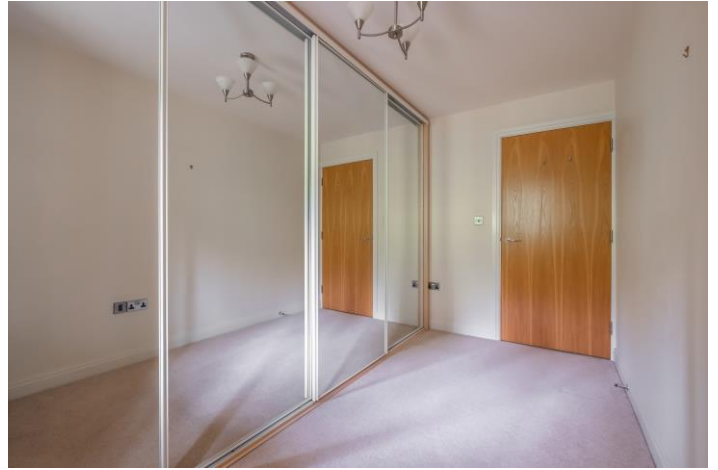
Bedroom 2 12'3 x 7'

With window to the rear, built in wardrobes with sliding doors and central heating radiator.