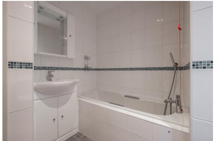
Bathroom 8'3" x 8'8" overall

A large bathroom, fitted with a 4 piece suite in white comprising low flush wc, vanity washbasin, bath and shower cubicle with multi-jet shower, fully tiled walls, inset spotlights to the ceiling, extractor and heated towel rail.