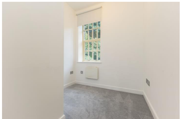
Bedroom 3 7'6" x 10'6" (5'4" min) A single bedroom with window to the front and electric heater.