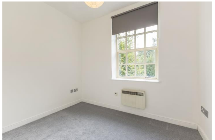
Bedroom 2 10'4" x 8' Another double bedroom with window to the rear and electric heater.