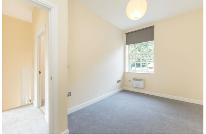
Bedroom 1 14'4" x 8'10" (6'9" min) A double bedroom with window to the front and electric heater.