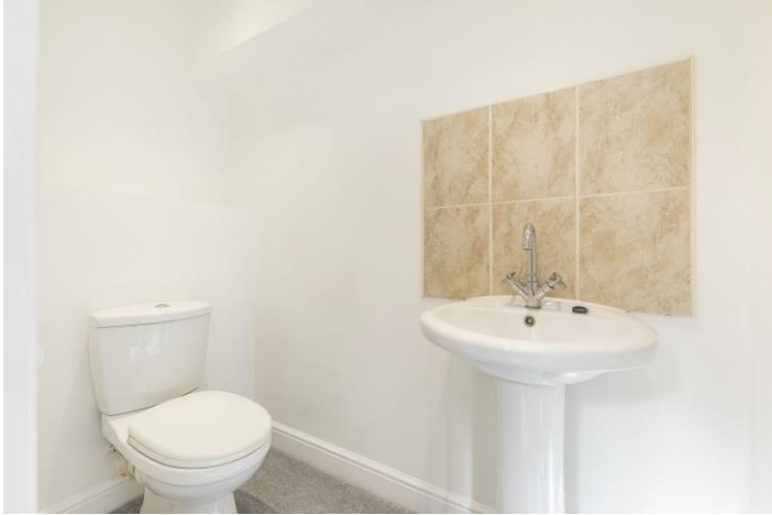
Downstairs WC 6'1" x 3'3" With low flush wc, pedestal washbasin, inset spotlights to the ceiling and extractor.