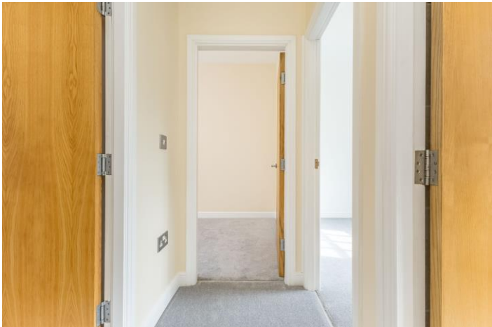
Landing With loft access.