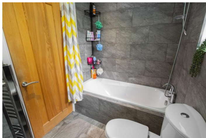
House Bathroom 7' 8" x 5' 4" max

Comprising of a three-piece suite in white including a low-level flush WC, pedestal hand wash basin and a bath. Over the bath is a shower attachment, the room is tiled to ceiling height around the bath and half height in the main. There is an obscure double-glazed window, a towel rail style radiator and tiled flooring.