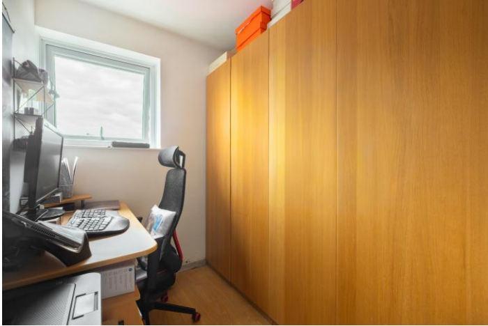
Bedroom 4 8' 8" x 6' 4" max

Bedroom four is a single bedroom and as the photograph shows is currently used as a home office. There is plumbing for a central heating radiator, although the radiator has been removed, and a double-glazed window giving a front aspect.