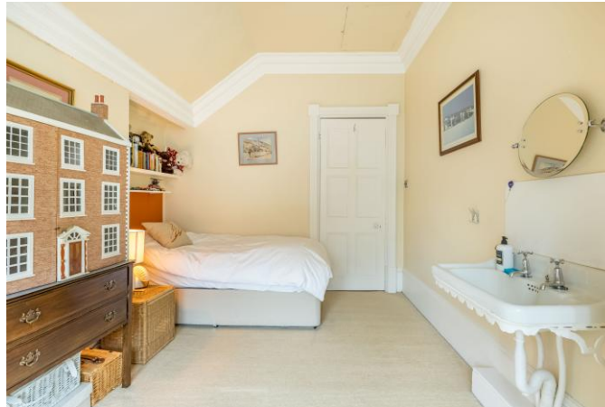
Bedroom 4 12'5" x 9'9"

With windows to the rear, high part angled ceiling with coving, 2 sets of recessed storage, wall hung washbasin and central heating radiator.