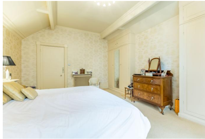
Bedroom 1 18'5" x 14'5" A double bedroom with mullioned windows to the front, chimney breast with built in cupboards to either side, high partly angled ceiling with coving, column radiator and pedestal washbasin.