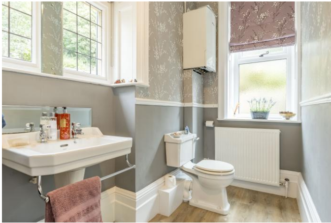
Cloakroom / WC 12'8" x 4'4" With traditional low flush wc and washbasin, windows to the side and rear, central heating boiler.

Dining Kitchen 26'2" x 12'8" A large open plan living / dining kitchen which features a bay window and additional windows to the rear, solid oak flooring and a wooden stable door to the rear. It features a traditional Aga range cooker and an excellent range of shaker style base units and wall cupboards with composite worksurfaces, with inset sink and mixer tap, dishwasher and recessed refrigerator. There is a recessed pantry store and additional storage beneath the stairs. A door and further staircase leads to the cellar.