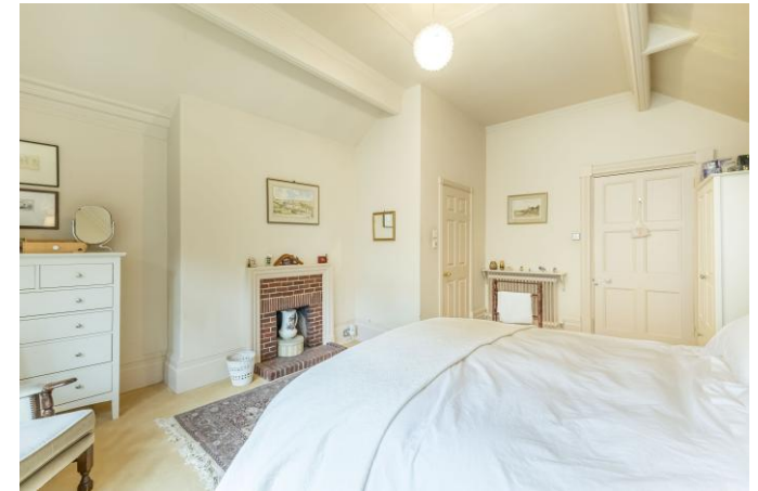
Bedroom 2 18'6" x 14'5" overall Another double bedroom with en-suite shower room, mullioned windows to the front, high partially angled ceiling with coving, chimney breast with feature brickwork fireplace and column radiator.