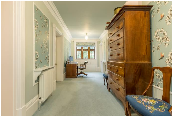
Landing 22'9" x 7'11" A large open landing area with high coved ceiling, 2 column radiators and windows to the side. The far end of the landing is used as a study area.