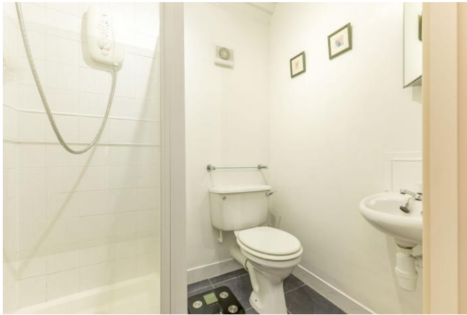
En-suite 5'9" x 4'4"

With low flush wc, washbasin and shower enclosure, tiled floor, partly tiled walls, heated towel rail and extractor.