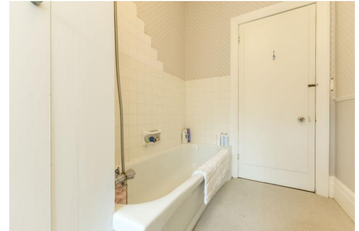
Bathroom 12'5" x 5'10" overall

A large house bathroom with high flush wc, pedestal washbasin, bath with shower over, built in airing cupboard, obscure glazed window to the rear, heated towel rail / column radiator and additional radiator.