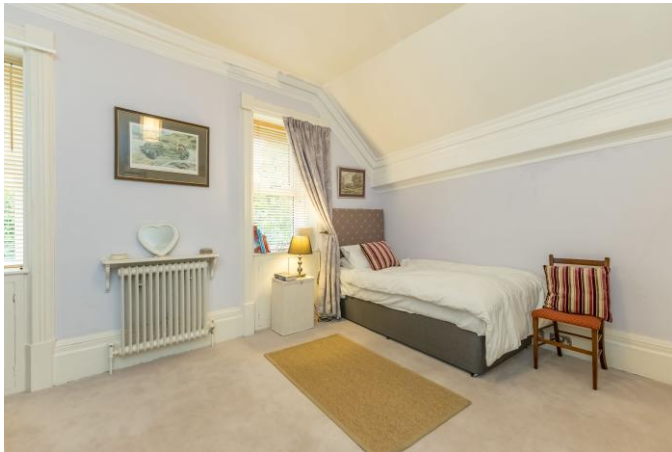
Bedroom 3 14'8" x 12'4"

With windows to the rear, high part angled ceiling with coving, 2 sets of recessed storage, wall hung washbasin and central heating radiator.