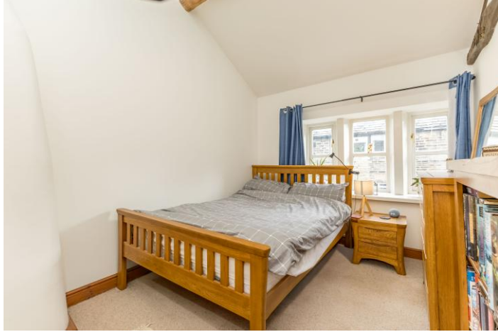
Bedroom 1 11'9" x 8'6"

With exposed roof truss to the high angled ceiling, central heating radiator.