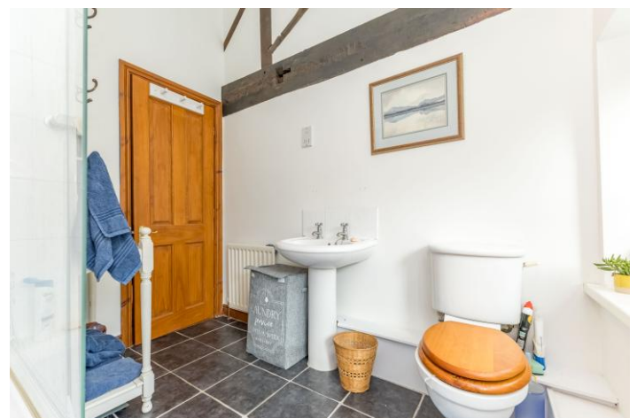
Bathroom 7'8" x 5'6" (8'6" max)

With low flush wc, pedestal washbasin, bath with shower over, exposed roof truss to the high angled ceiling, obscure glazed windows to the front, tiled floor and central heating radiator.