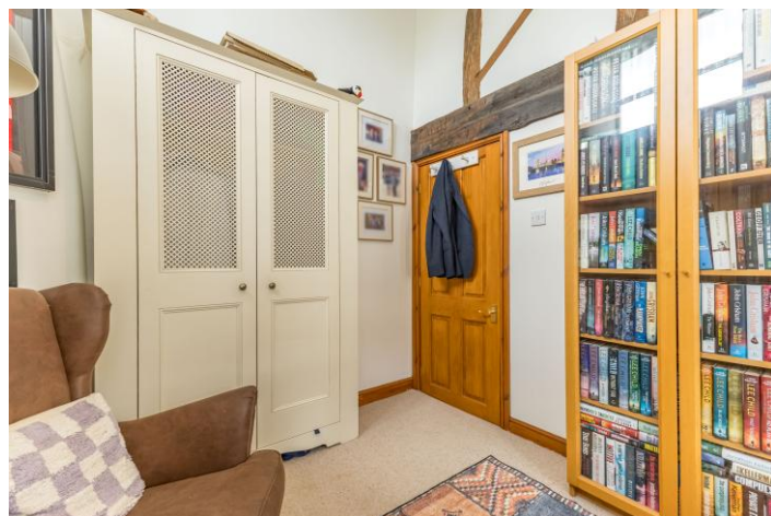
Bedroom 2 11'8" x 8'5"

With mullioned windows to the rear, exposed roof truss to the high angled ceiling, fitted wardrobe and central heating radiator.