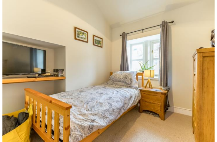
Bedroom 3 8'2" x 7'5"

With mullioned windows to the rear, exposed roof truss to the high angled ceiling, fitted wardrobe and central heating radiator.