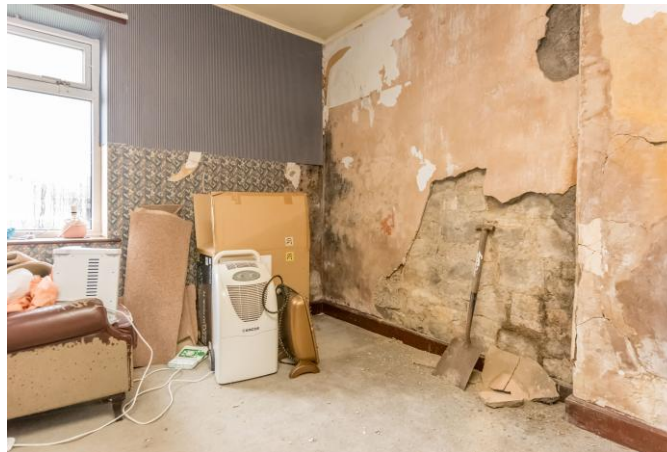
Bedroom 4 11'8" x 8'10" With window to the front.