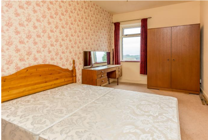
Bedroom 1 8'8" x 16'5" (19' max) With window to the front and central heating radiator.

A spacious landing area with window to the rear and built in cupboards.