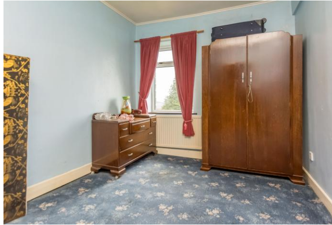
Bedroom 3 13'3" x 8'11" With window to the front and central heating radiator.