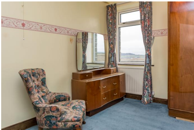
Bedroom 2 12'4" x 8'11" With window to the front and central heating radiator.