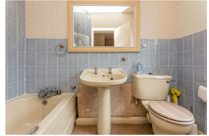
Bathroom 7'4" x 5'7" With obscure glazed window to the rear, low flush wc, pedestal washbasin and bath with shower over, partly tiled walls, central heating radiator.