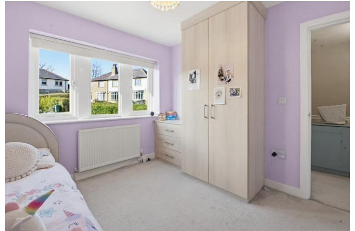
Bedroom 2 10' 5" x 10' max This good size double bedroom has built-in wardrobes and drawers, central heating radiator, and double-glazed windows, allowing views to The Crescent.