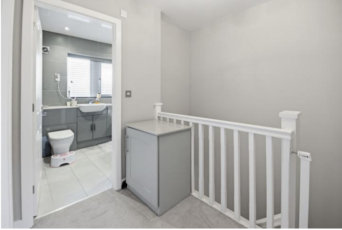
Landing Doors lead off.