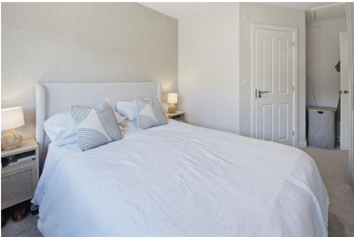
Bedroom 1 15' 7" x 10' max Located to the rear of the property and enjoying particularly impressive views, the room has an array of built-in wardrobes and drawers, central heating radiator, double-glazed window and access is given to the bedrooms en-suite.