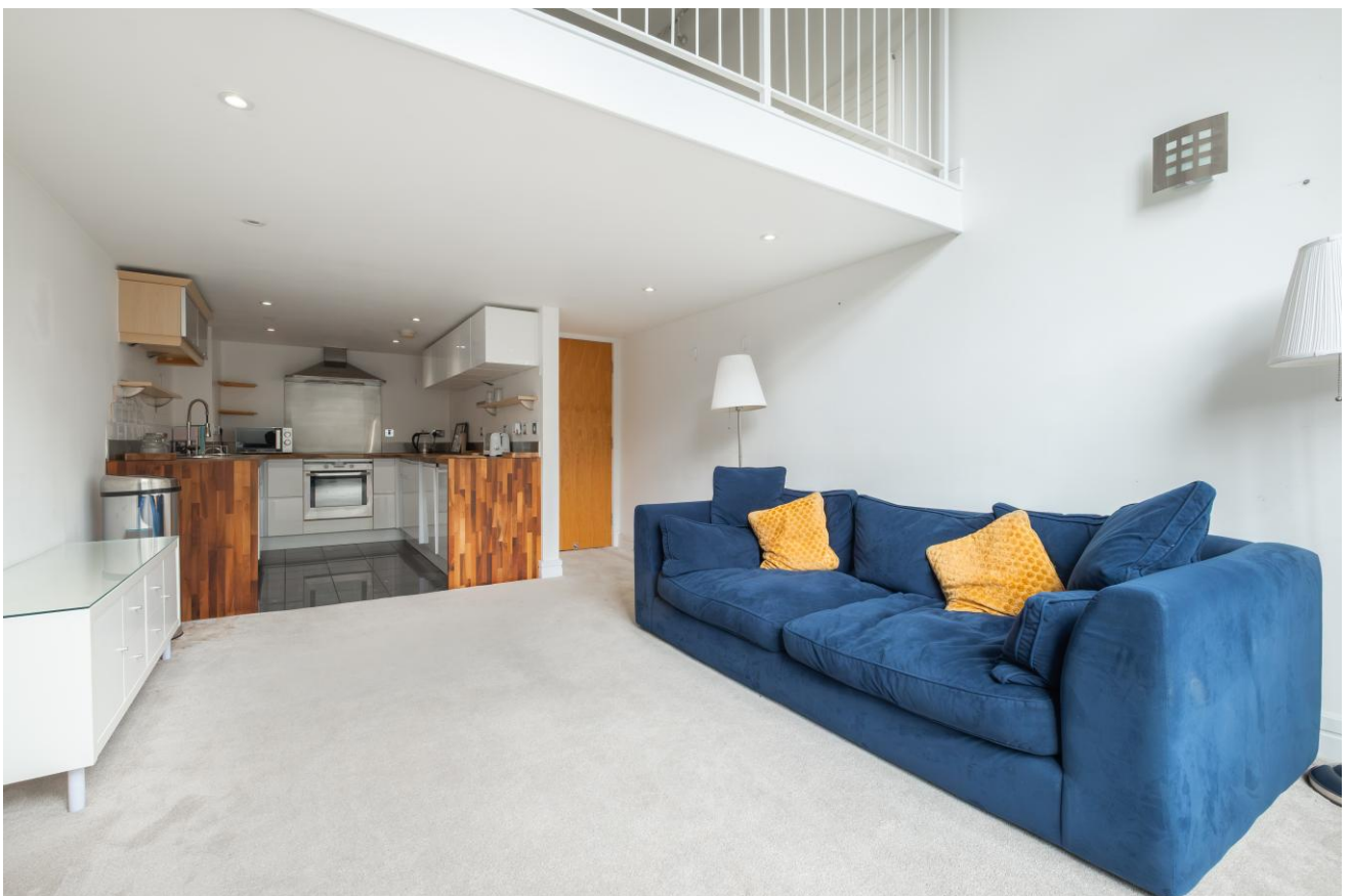
Open Plan Living, Dining & Kitchen