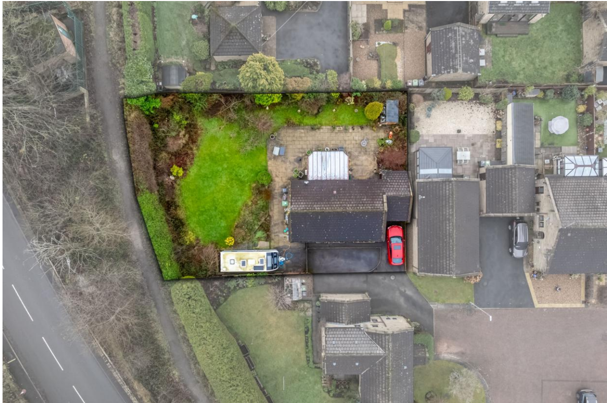
15 River Holme View, Brockholes