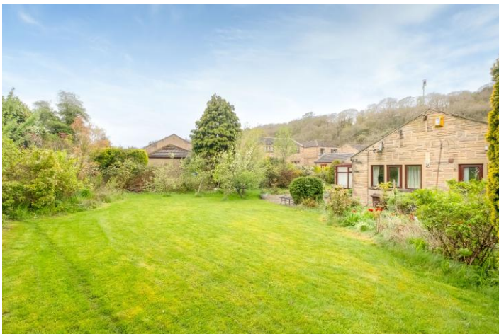
Outside Rear and Gardens