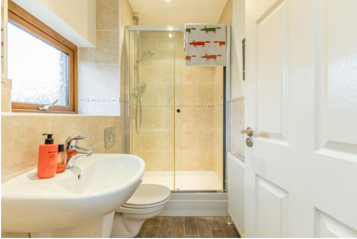
En-suite 7'8" x 4'7"

Featuring a modern 3 piece suite in white comprising of a double sized shower cubicle, semi pedestal washbasin and wc, half tiled walls, inset spotlights, extractor and central heating radiator.