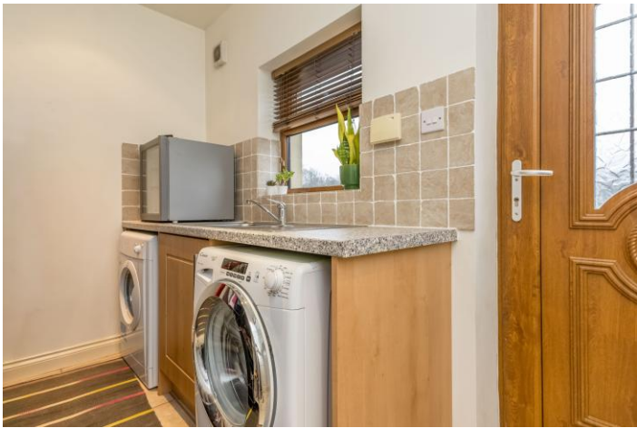
Utility 10'6" x 5'7" Featuring a 1 1/2 stainless steel sink unit with mixer tap, plumbing for automatic washing machine, rear entrance door, central heating radiator. Door to the dining room.