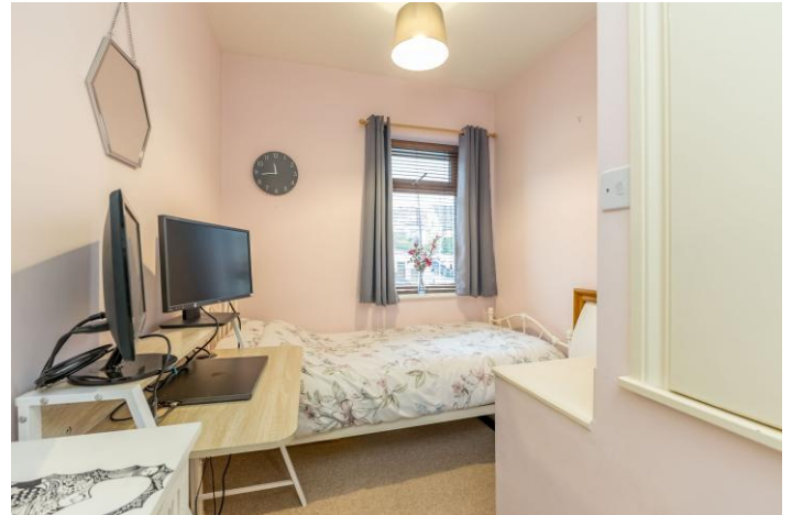
Bedroom 4 9'11" x 6'10" (includes bulkhead)

A double bedroom with window to the front and central heating radiator.