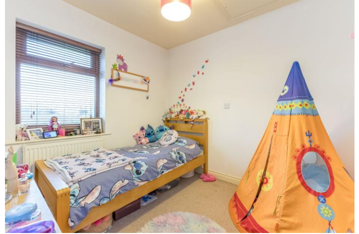
Bedroom 3 9'3" x 8'8"

Featuring a modern 3 piece suite in white comprising of a double sized shower cubicle, semi pedestal washbasin and wc, half tiled walls, inset spotlights, extractor and central heating radiator.