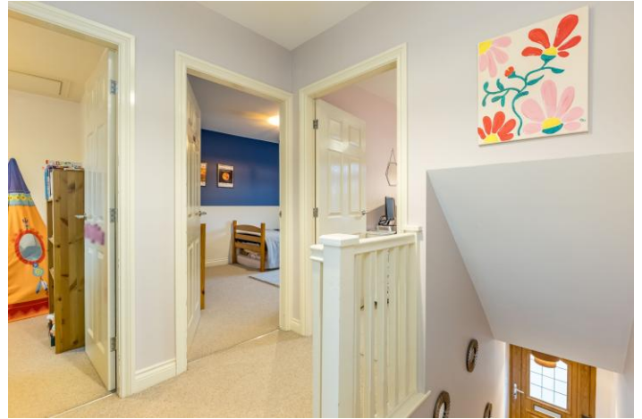
Landing With doors leading off.