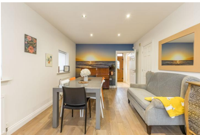
Dining / Living Room 16'11" x 10'6" A good sized second reception room with window to the front, 2 windows to the side, inset spotlights to the ceiling and central heating radiators. There is also an additional access to the understairs storage area.