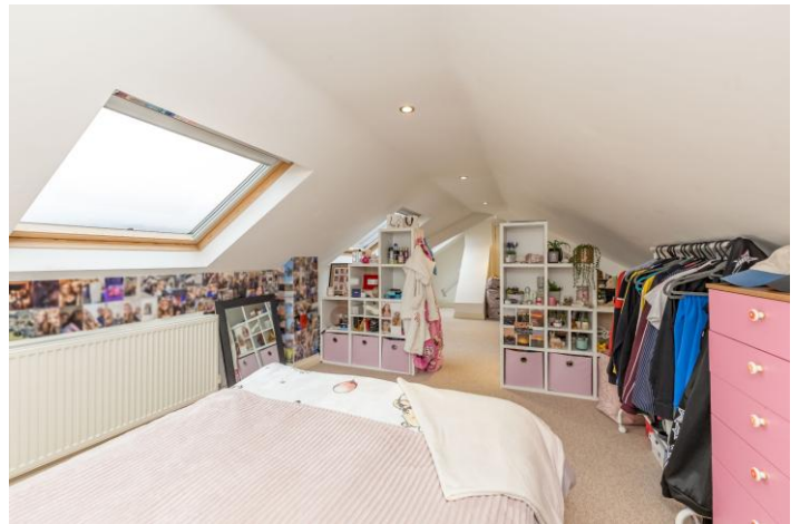
Attic Room 25'10" x 11'3"

This large attic room is accessed via a retractable ladder from bedroom 3. It features 3 velux rooflights to the angled ceiling and 2 central heating radiators.