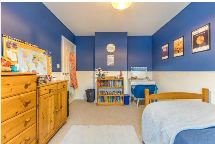
Bedroom 2 13'5" x 9'7"

A double bedroom with window to the front and central heating radiator.