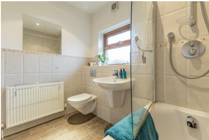
Bathroom 7'8" x 6'2"

A superb bathroom which features a modern three piece suite in white comprising of a bath, semi pedestal washbasin and wc, tiled walls, tiled floor and central heating radiator.