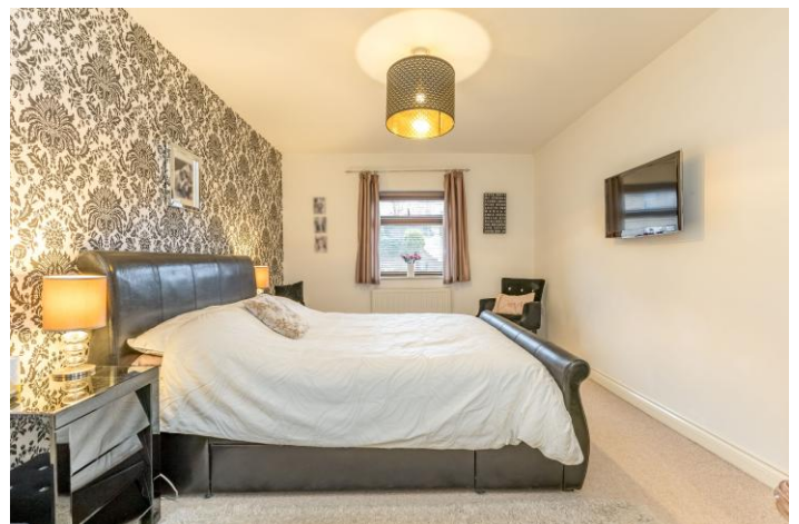
Bedroom 1 13'2" x 10'6" With windows to the front and side, central heating radiator.