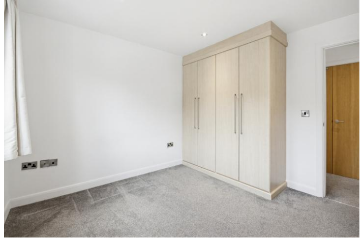
Bedroom 2 10' 10" x 10' 4" max

This double bedroom has a bank of built-in wardrobes, spotlights to the ceiling, wall mounted electric heater, double-glazed window and a door leads to the en-suite.