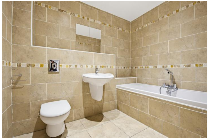
Bathroom 7' 8" x 6' 4"

Comprising of a three-piece suite in white, including a hand wash basin, concealed flush WC and walk-in glazed shower. The en-suite has an extractor fan, inset spotlights to the ceiling, an obscure double-glazed window and a heated towel rail style radiator.