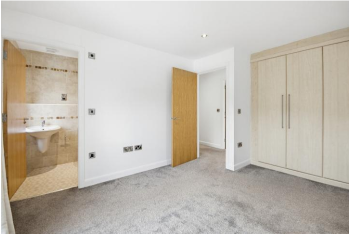
Bedroom 1 12' 10" x 11' max

This double bedroom has a bank of built-in wardrobes, spotlights to the ceiling, wall mounted electric heater, double-glazed window and a door leads to the en-suite.