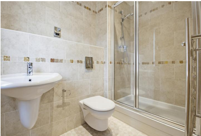
En-Suite 7' 8" x 4' 10"

Another double bedroom with built-in wardrobes, inset spotlights to the ceiling, wall mounted electric heater and double-glazed window.