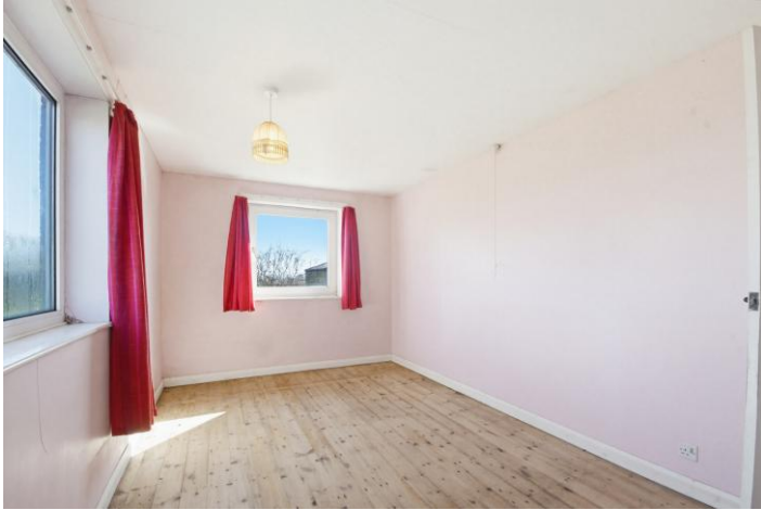
Bedroom 1 16'1" x 9'3" A good sized double bedroom with windows to the side and rear enjoying the views.