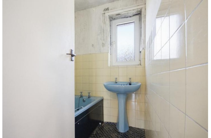
Bathroom 5'7" x 4'9" With 2 piece suite in blue, tiled walls and obscure glazed window to the front.