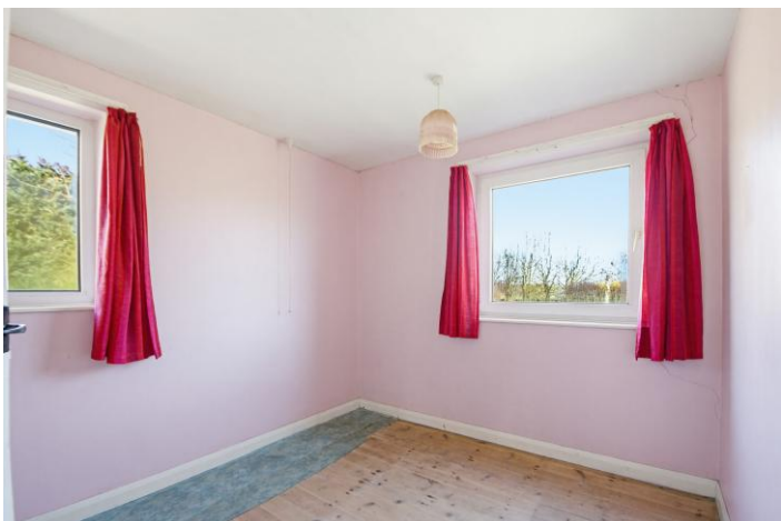
Bedroom 3 9'2" x 8'3" With windows to the front and side.