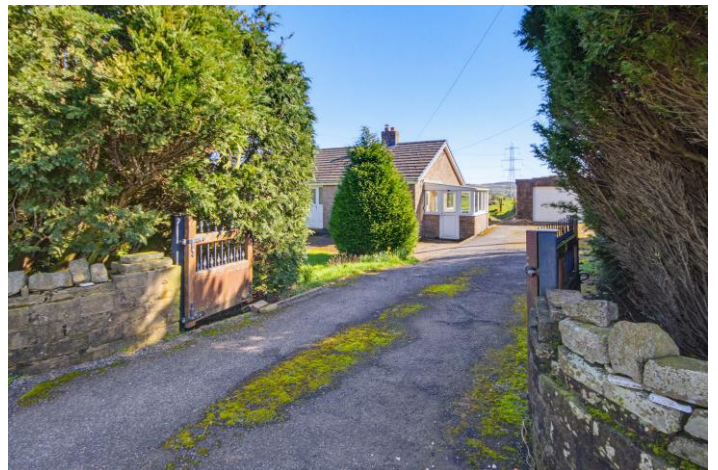
WC 5'7" x 2'6" With low flush wc and obscure glazed window to the front.