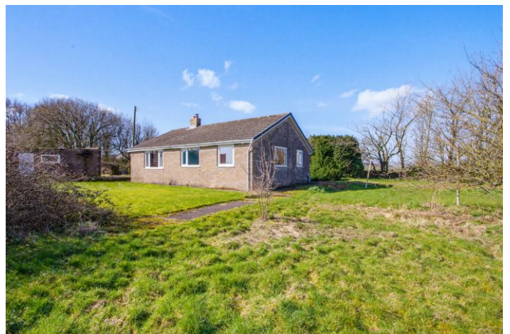
OUTSIDE The property sits within a generous plot of approximately 0.31 acres. It has a gated tarmac driveway providing parking and access to the detached single garage with up and over door. There are lawned gardens surrounding the bungalow to the front, side and rear.