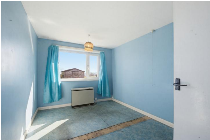
Bedroom 2 12'9" x 9'3" Another double bedroom with window to the rear and electric storage heater.