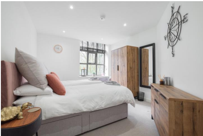
Bedroom 2 13'2" x 10'7" overall

A larger double bedroom with window to the rear, inset spotlights to the ceiling and electric heater.