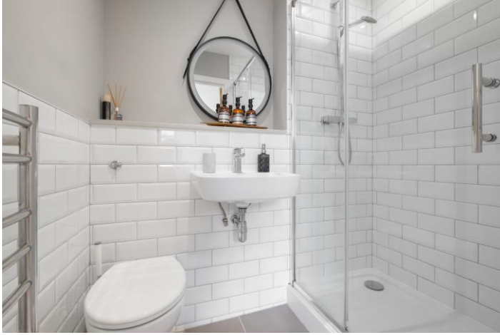
En-suite 5'3" x 6'7"

With three piece suite in white comprising low flush wc, wall hung washbasin and shower cubicle with overhead and rinse shower, tiled floor, tiled splashbacks, heated towel rail, inset spotlights and extractor fan.