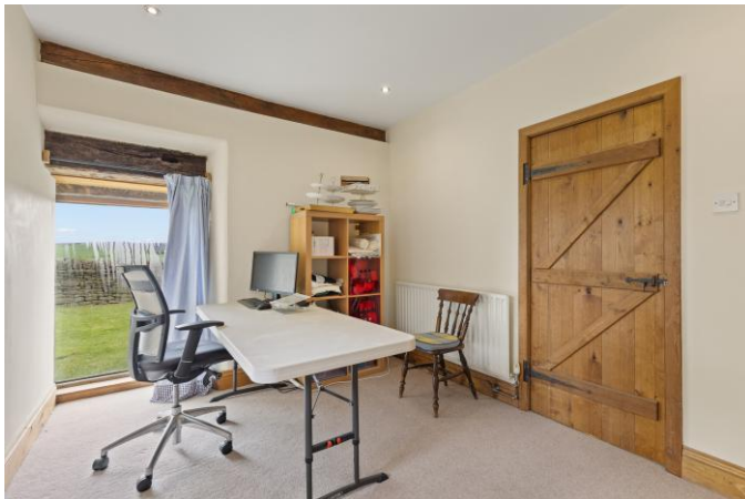
Bedroom 4 12' x 9'3"

A double bedroom with windows to the side and rear, central heating radiator.