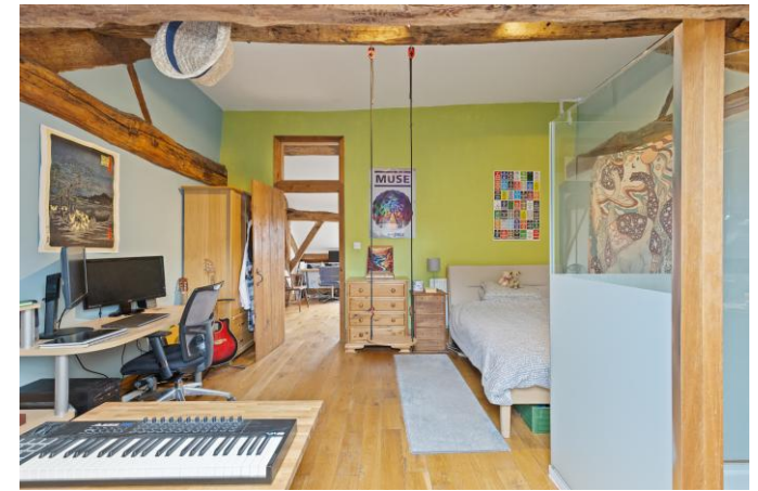
Bedroom 3 16'6" x 14'6" Another double bedroom which features exposed roof trusses and velux rooflight to the angled ceiling, central heating radiator. There is an open en-suite area which is partially enclosed by glazed screens. It features a low flush wc, vanity washbasin and shower enclosure.