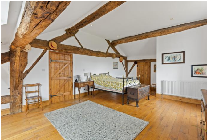
Bedroom 1 25' x 14'10" A large principal bedroom which features exposed roof frame to the high angled ceiling, wooden floorboards, 2 central heating radiators and recessed storage cupboard into the eaves.