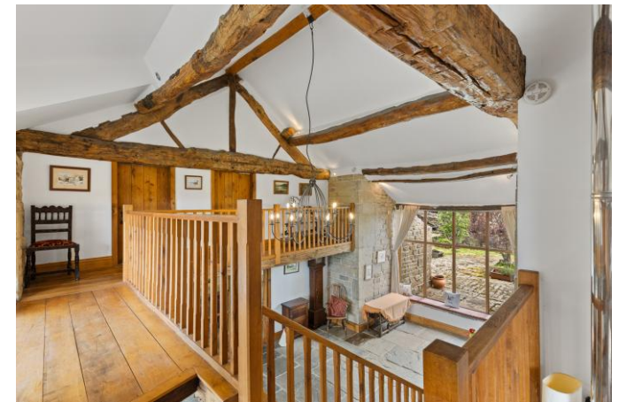
Galleried Landing 10' x 9'

With fitted base units with laminated worksurfaces, integrated oven, stainless steel sink unit with mixer tap, tiled splashbacks, windows to the side and rear, exposed beams to the angled ceiling, wooden entrance door to the rear. Note that the dimensions incorporate the downstairs wc.