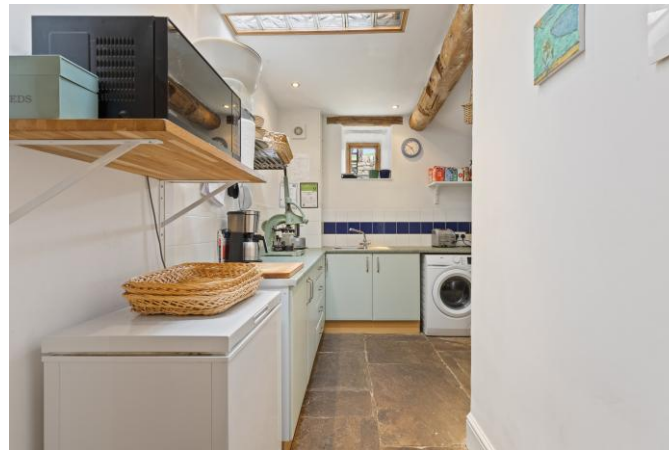
Utility / Rear Entrance 15'9" x 9'7" overall

A double bedroom with windows to the side and rear, central heating radiator.