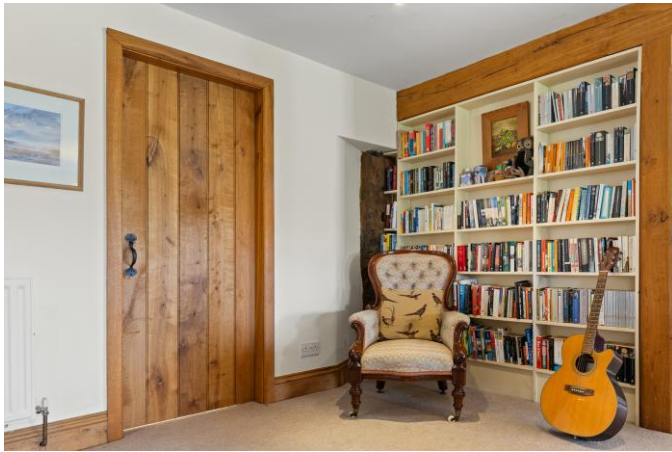
Lounge 29'6" x 27'5"

Split over 2 levels, this stunning open living space can be utilised in different ways depending upon the needs of the next owner. The upper level is currently a living space with stone chimney breast and multifuel stove being the focal point of the room. There are inset spotlights to the ceiling, windows to the front and a central heating radiator. The lower level features further windows to the front and side along with a glazed door to the garden and central heating radiator.