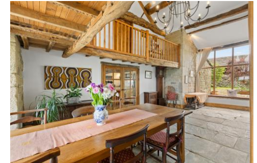
Dining Hall 28'4" x 15'9" overall

A wonderful hall which sits at the heart of the building featuring a stone flagged floor with underfloor heating, picture windows to the front and rear elevations, exposed stonework to the internal walls, stairs leading to the first floor, and last but not least exposed roof trusses to the high angled ceiling above.