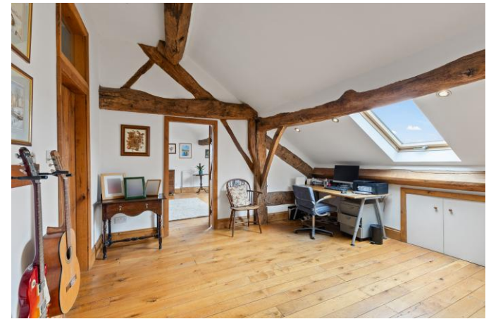
Bedroom 2 12'2" x 14'3" A double bedroom with 2 velux rooflights to the angled ceiling in a cutaway recess, exposed roof truss to the angled ceiling and 2 central heating radiators.