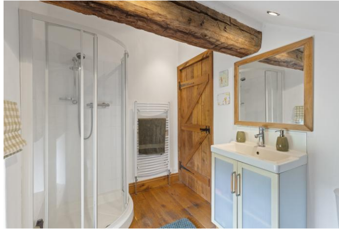
En-suite 10'2" x 5'11" overall With low flush wc, vanity washbasin and shower enclosure, low level window to the side, heated towel rail and wooden floorboards.