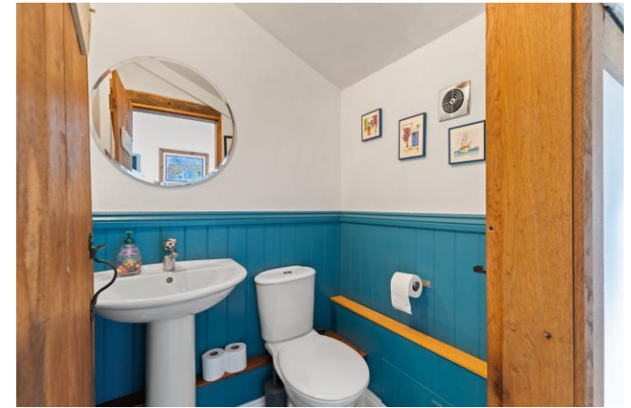
Downstairs WC 4'4" x 4'3" With low flush wc, pedestal washbasin and stone flagged floor.

Another double bedroom with window to the rear and central heating radiator.