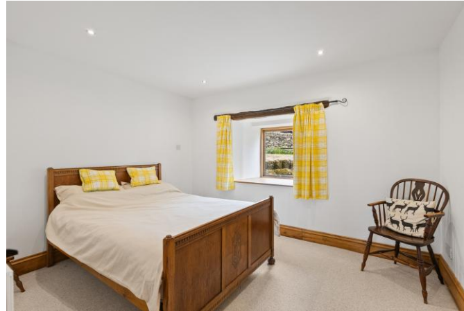
Bedroom 5 11'7" x 9'3"

En-suite 9'3" x 4'7" Located up a step from the bedroom, with exposed timber upright, partly tiled walls tiled floor, window to the rear, extractor and heated towel rail. There is a 3 piece suite in white comprising low flush wc, vanity washbasin and shower enclosure.